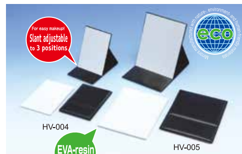
PROFESSIONAL MODEL MIRROR

Three types of EVER-CLEAR MIRRORS with excellent performance