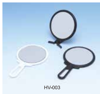
STAND & HAND MIRROR