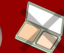
mismatch of the colors between your skin and a foundation,