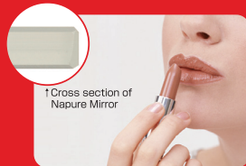
↑ Cross section of Napure Mirror