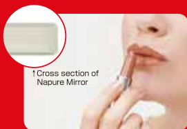
1 Cross section of Napure Mirror