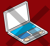
too much eye shadow.

... because of incorrectly reflected colors !