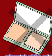
mismatch of the colors between your skin and a foundation,