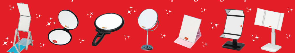
HAIR CHECK-UP MIRROR

The line of "Napure Mirror" items reflect the natural color of your skin and your beauty. New items are produced one after another responding to the good reputation.