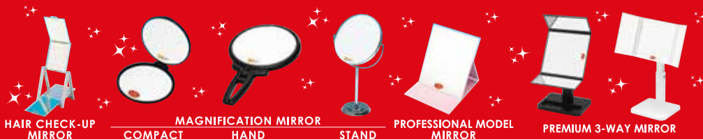
HAIR CHECK-UP MIRROR

The line of "Napure Mirror" items reflect the natural color of your skin and your beauty. New items are produced one after another responding to the good reputation.