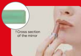
1 Cross section of the mirror