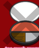
too much rouge on your cheeks, and