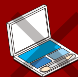
too much eye shadow.

... because of incorrectly reflected colors !