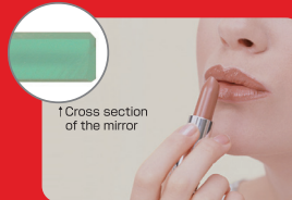
↑ Cross section of the mirror