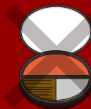
too much rouge on your cheeks, and