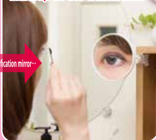
The photo shows an image of reflection in the magnification mirror.

Convenient for your makeup at the washstand